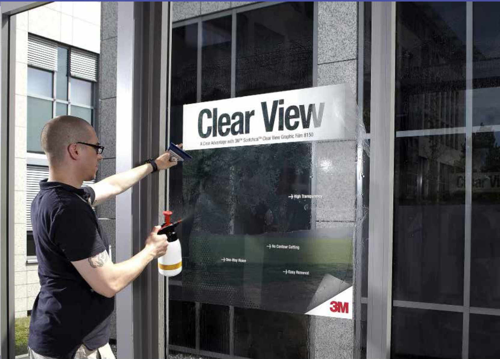
Making a perfect wet application of 3M™ Scotchcal™ Clear View Graphic Film 8150 | Step 15: