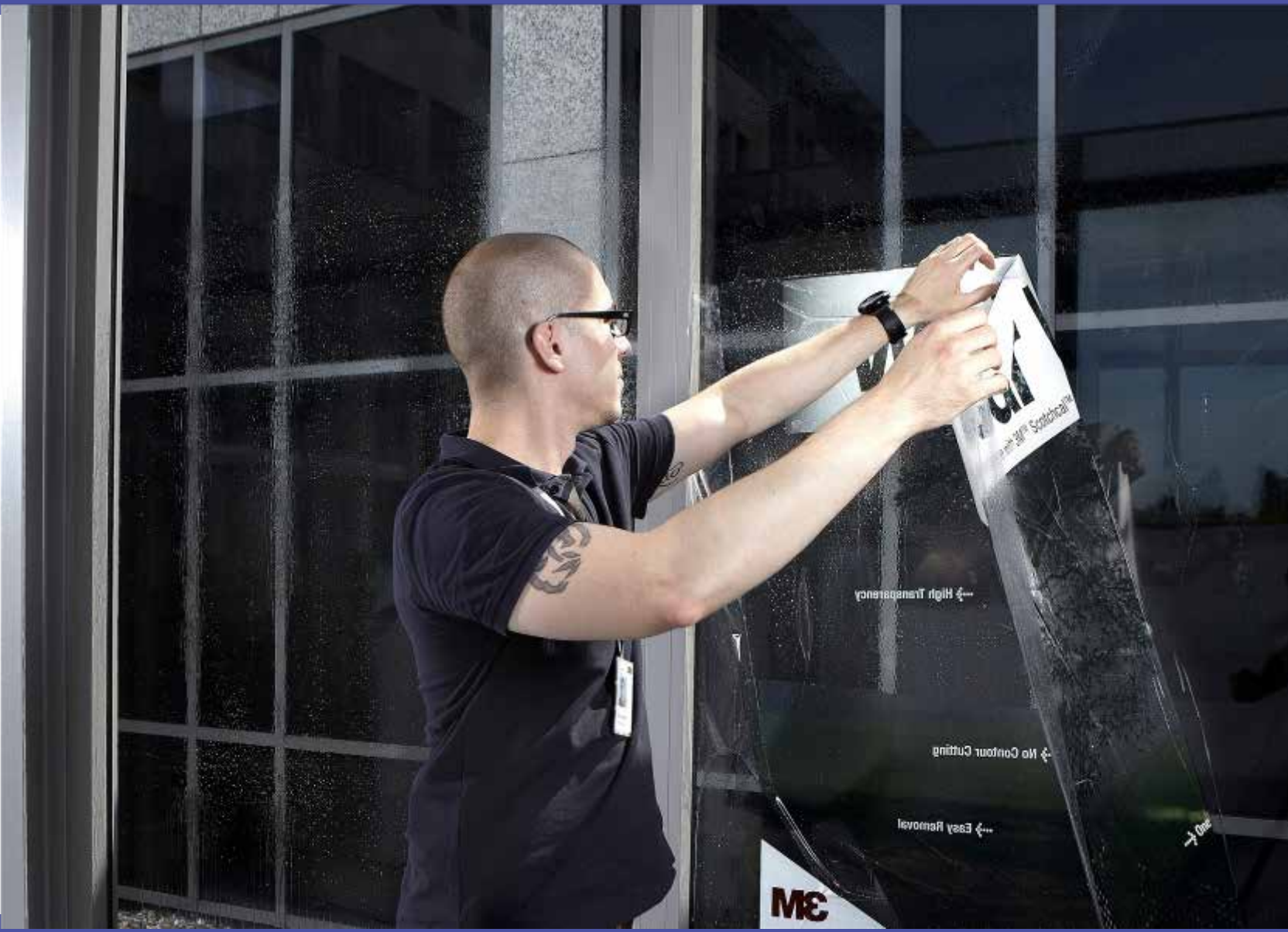
Making a perfect wet application of 3M™ Scotchcal™ Clear View Graphic Film 8150 | Step 10: