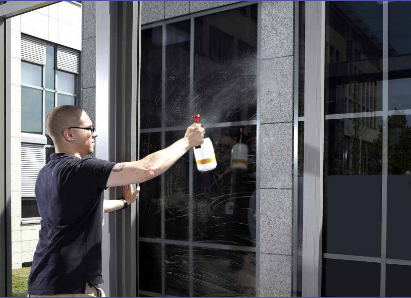
Making a perfect wet application of 3M™ Scotchcal™ Clear View Graphic Film 8150 | Step 3: