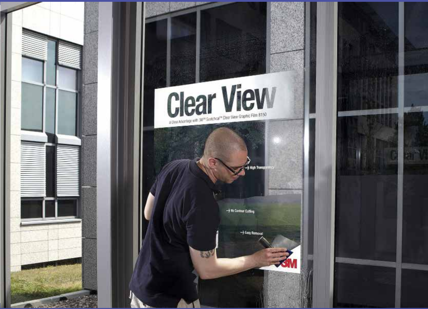
Making a perfect wet application of 3M™ Scotchcal™ Clear View Graphic Film 8150 | Step 17: