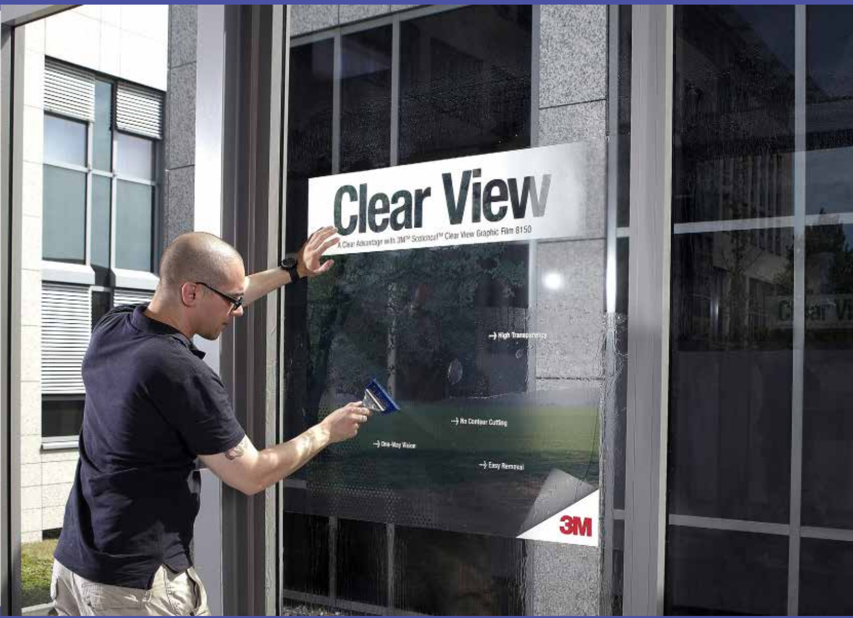
Making a perfect wet application of 3M™ Scotchcal™ Clear View Graphic Film 8150 | Step 16:

Install graphic: Squeeze the water out. Always start from the center to the different directions.