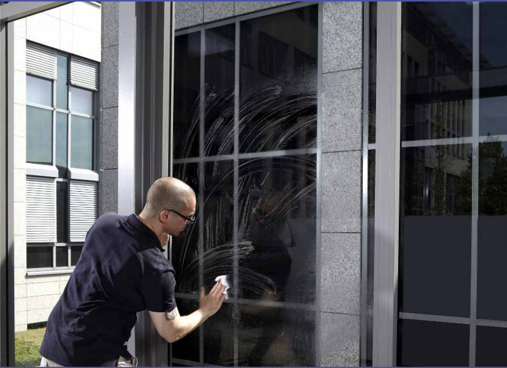
Making a perfect wet application of 3M™ Scotchcal™ Clear View Graphic Film 8150 | Step 2: