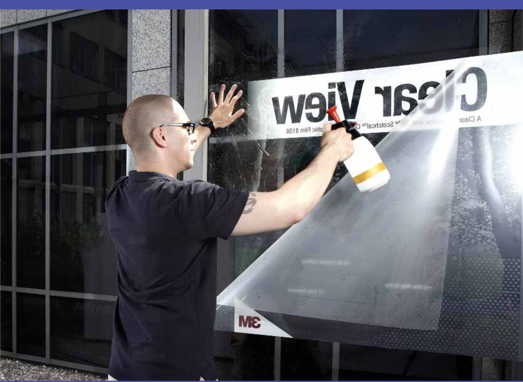
Making a perfect wet application of 3M™ Scotchcal™ Clear View Graphic Film 8150 | Step 8:

Prepare graphic installation: Continuous spraying onto the adhesive during liner removal.