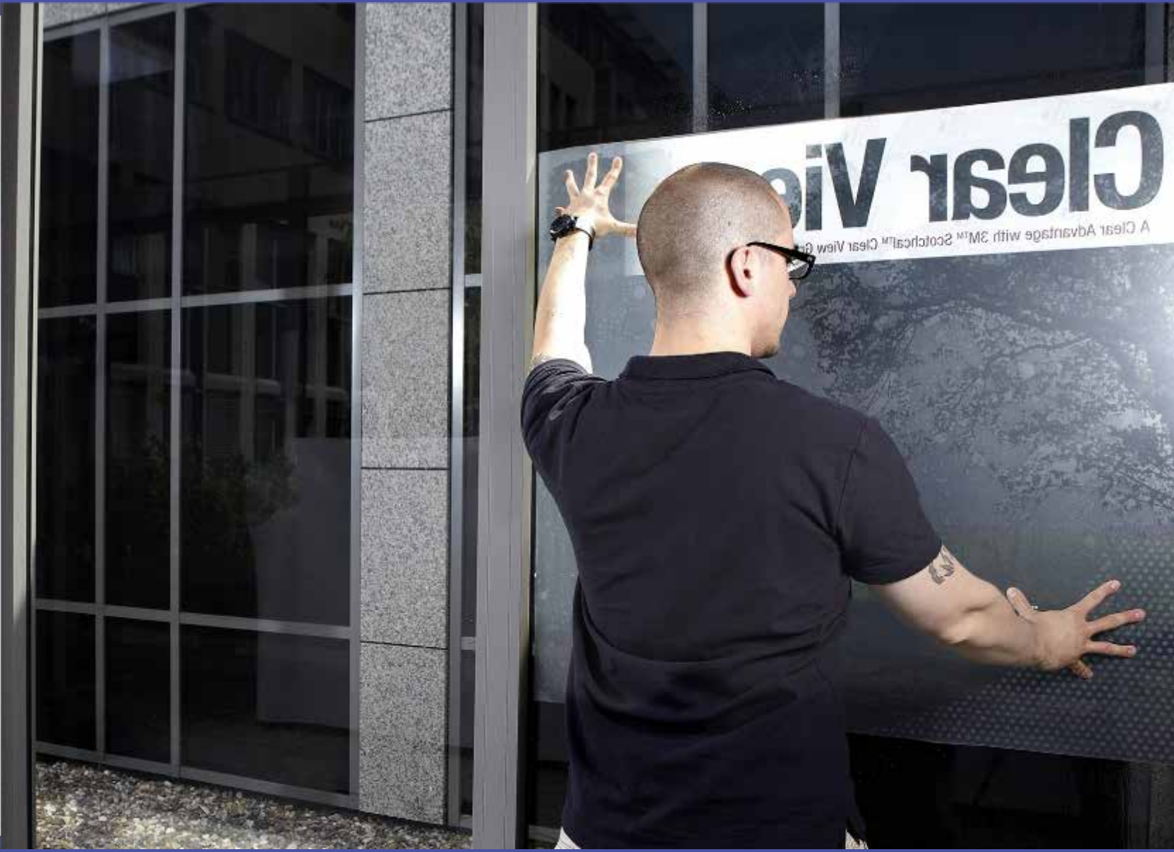
Making a perfect wet application of 3M™ Scotchcal™ Clear View Graphic Film 8150 | Step 6:

Prepare graphic installation: ... and stick the graphic backside (liner) up.