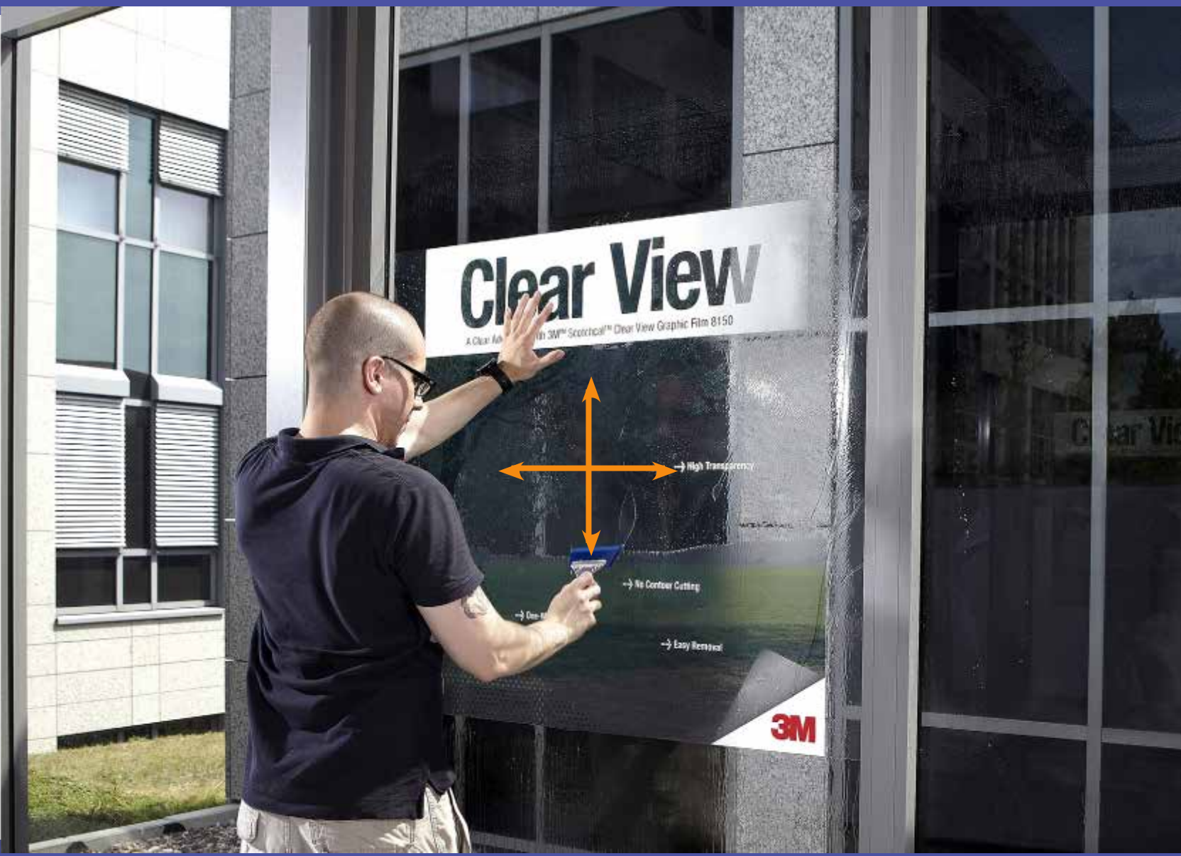
Making a perfect wet application of 3M™ Scotchcal™ Clear View Graphic Film 8150 | Step 14:

Install graphic: Starting from the center, squeeze first horizontal and then vertical to fix graphic position.