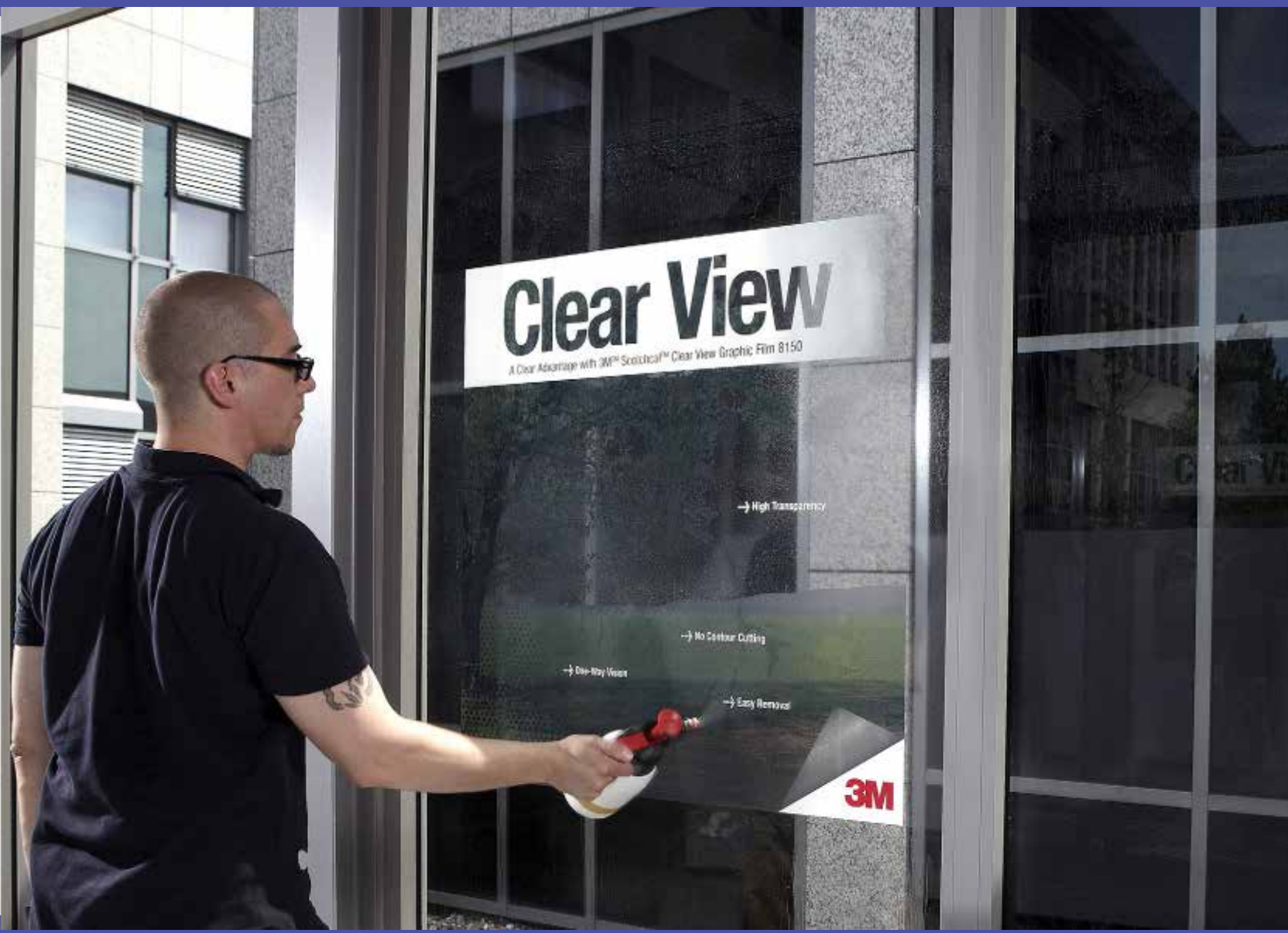
Making a perfect wet application of 3M™ Scotchcal™ Clear View Graphic Film 8150 | Step 13:

Install graphic: Spray detergent water onto graphic. This is for scratch prevention!