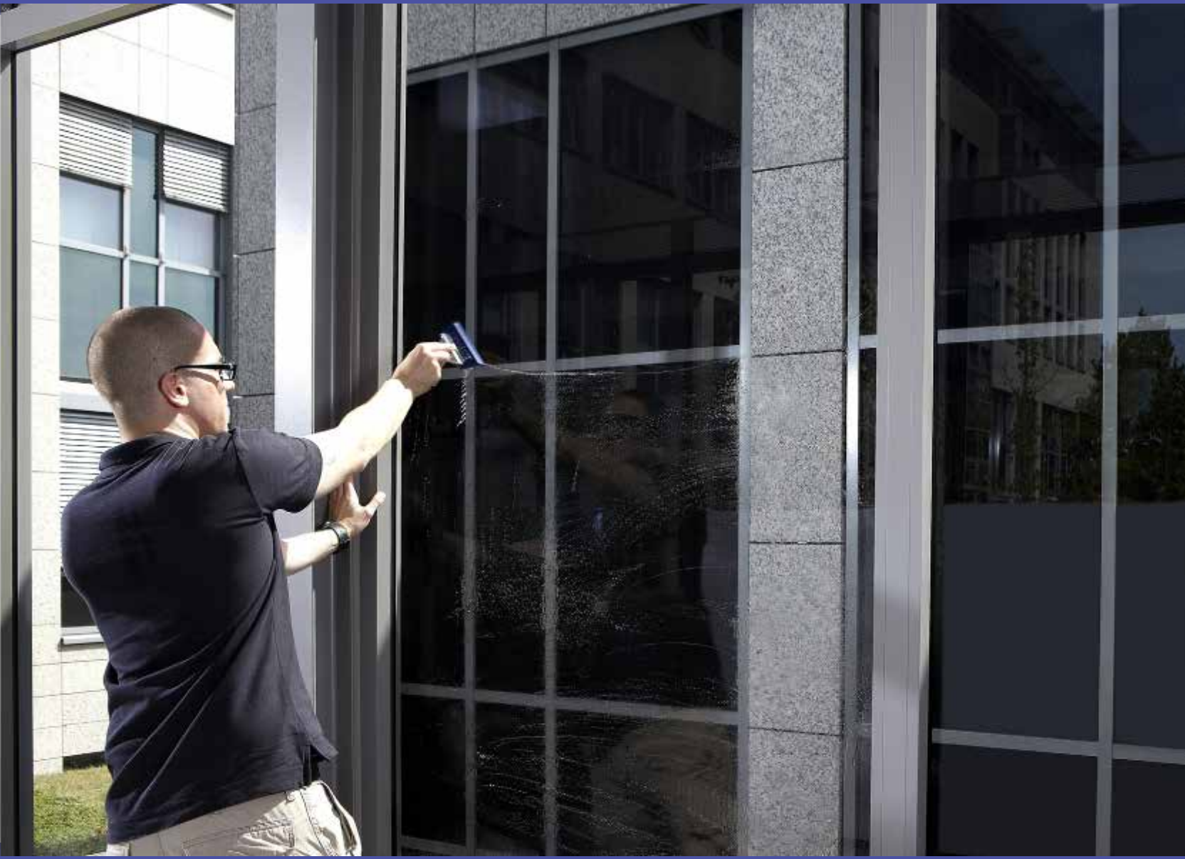
Making a perfect wet application of 3M™ Scotchcal™ Clear View Graphic Film 8150 | Step 4: