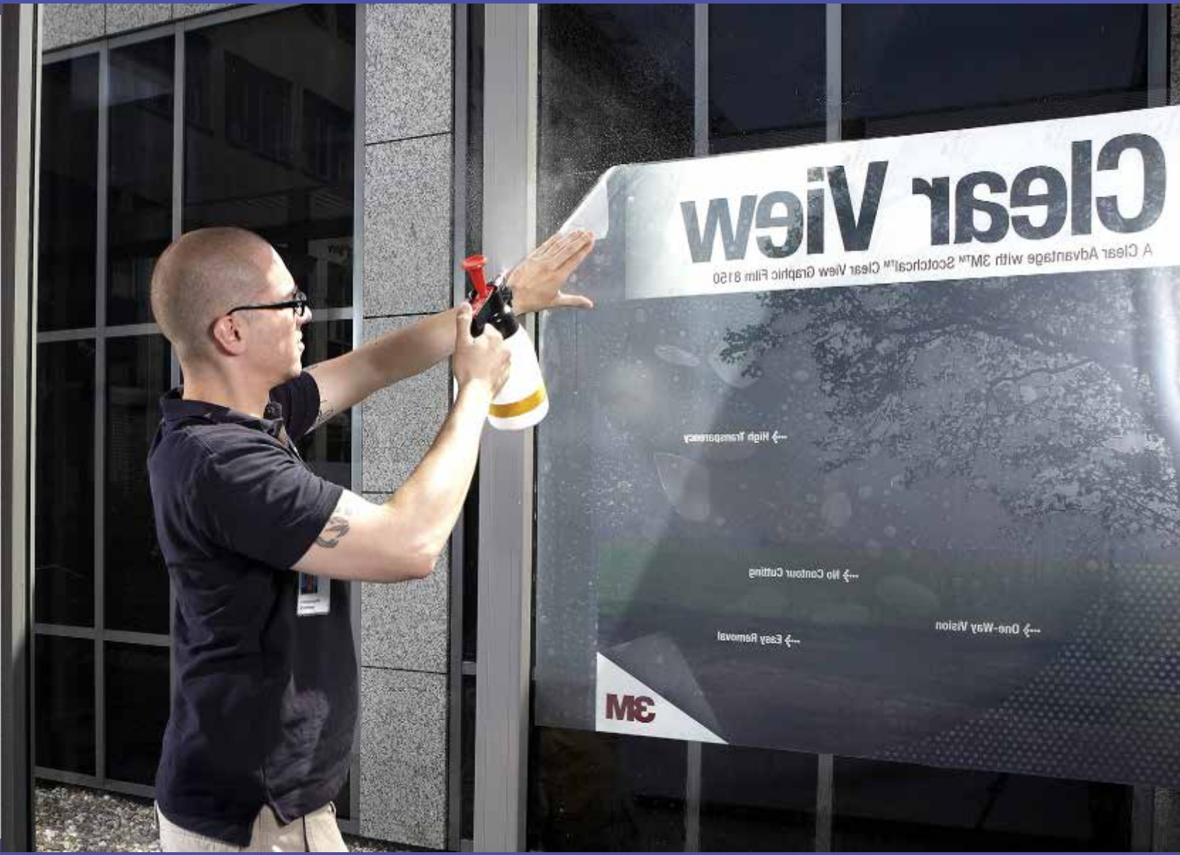
Making a perfect wet application of 3M™ Scotchcal™ Clear View Graphic Film 8150 | Step 7: