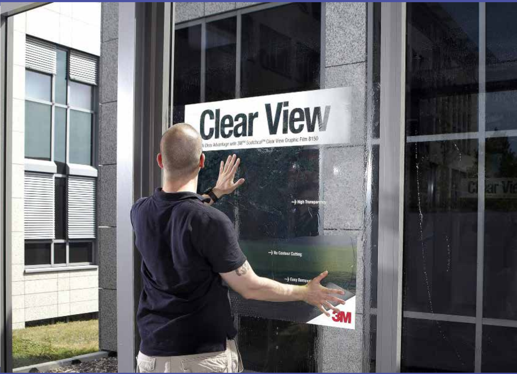
Making a perfect wet application of 3M™ Scotchcal™ Clear View Graphic Film 8150 | Step 12:

Install graphic: ... position it on the application surface.