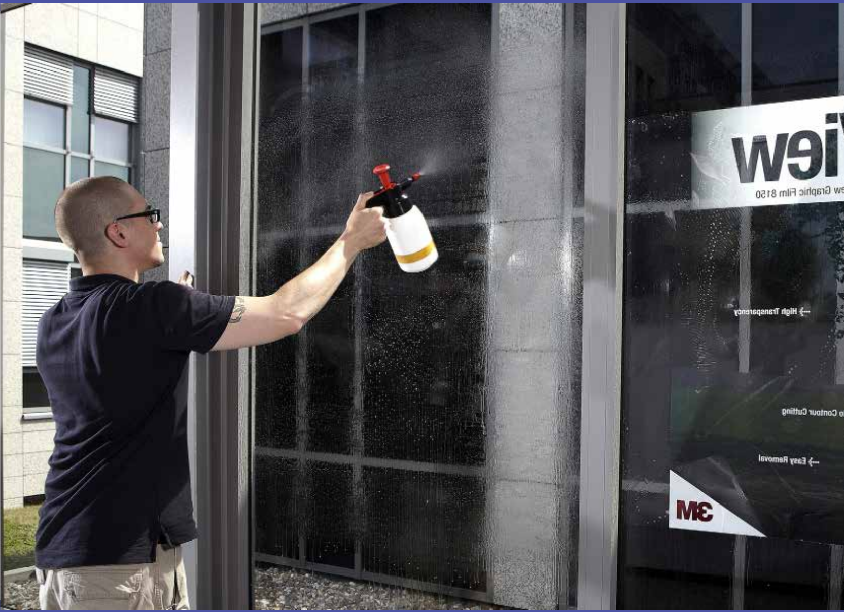
Making a perfect wet application of 3M™ Scotchcal™ Clear View Graphic Film 8150 | Step 9:

Install graphic: Spray the detergent water onto complete application area.