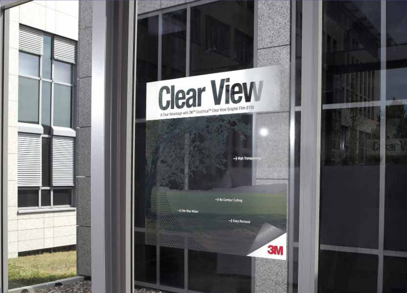
Making a perfect wet application of 3M™ Scotchcal™ Clear View Graphic Film 8150 | Step 20: