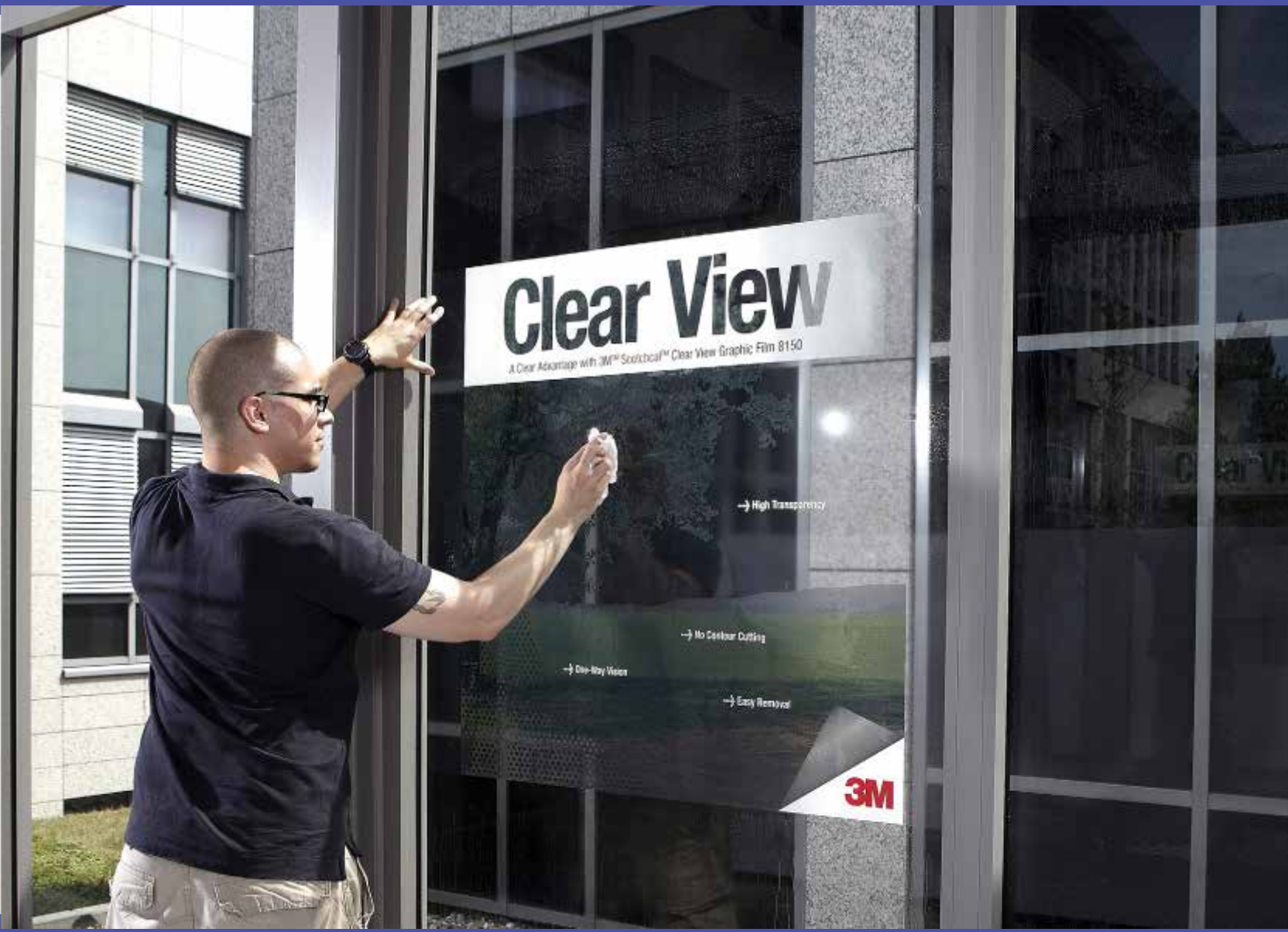
Making a perfect wet application of 3M™ Scotchcal™ Clear View Graphic Film 8150 | Step 19:

Post work: ... clean the graphic with a towel.